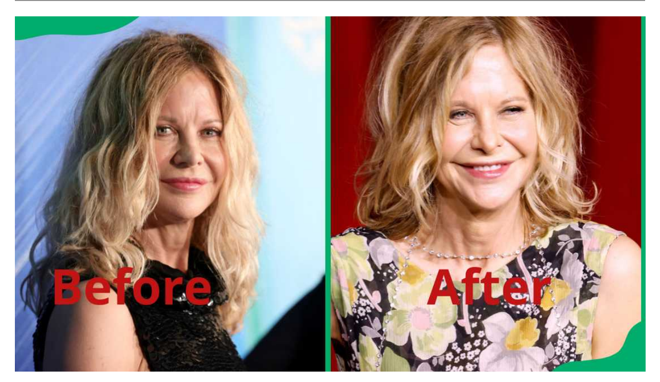
Meg Ryan may have used Botox injections to make her forehead appear smoother with no wrinkles.

The actress is alleged to have used Botox injections. Her eyebrows and forehead have transformed. The skin of her forehead appears tightened with no wrinkles. The actress's eyebrows also appear raised, and her eyes smaller than before.